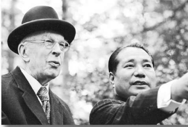
Daisaku Ikeda with Dr. Arnold J. Toynbee (London, May 1972)