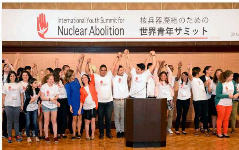
Participants in the International Youth Summit for Nuclear Abolition (Hiroshima, August 2015)