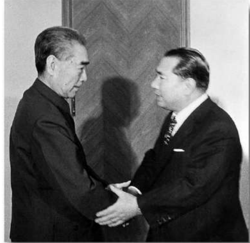
Meeting Chinese Premier Zhou Enlai (Beijing, December 1974)