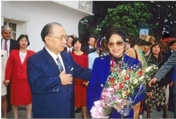
With Rosa Parks (Los Angeles, January 1993)