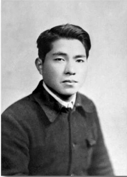
Daisaku Ikeda as a young man (Tokyo, 1947)