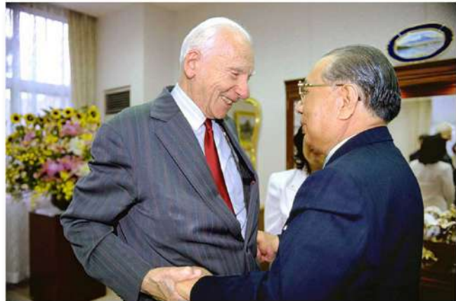
Meeting Dr. Joseph Rotblat (Okinawa, 2000)