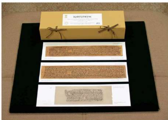
Gilgit Lotus Sutra Manuscripts from the National Archive of India, Facsimile Edition (published by Soka Gakkai, 2012)