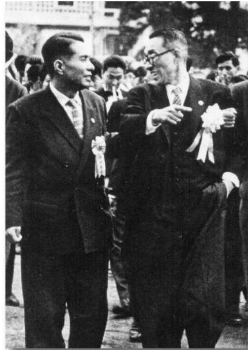
Daisaku Ikeda (left) with his mentor, Josei Toda (1958)