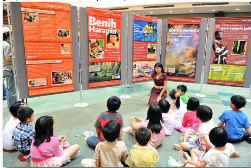
The “Seeds of Hope” exhibition jointly created by the SGI and the Earth Charter International (Malaysia, 2012)