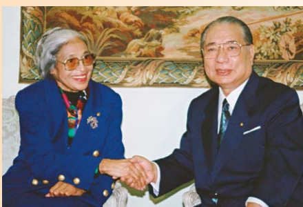
Meeting Rosa Parks in Los Angeles, CA (Jan. 1993)