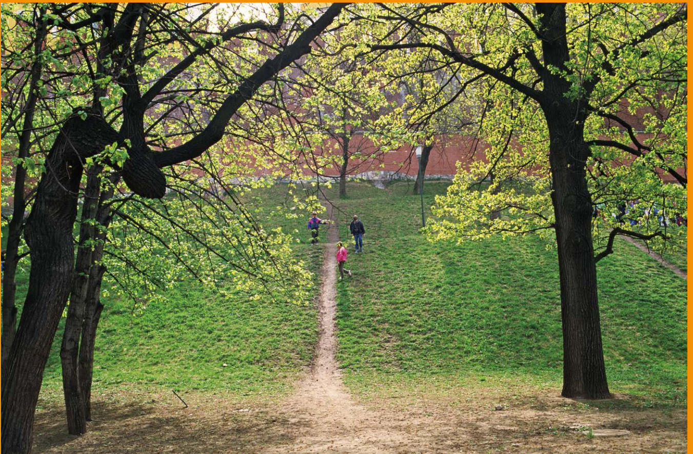
Moscow, May 1994

BUDDHIST PHILOSOPHER | PEACE THROUGH DIALOGUE