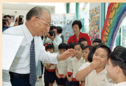
At the Singapore Soka Kindergarten (Nov. 2000)

▶ The Soka Amazon Institute was established in 1992 based on Ikeda’s environmental vision. Since its founding, it has promoted initiatives in environmental protection, reforestation, environmental education and research. ■